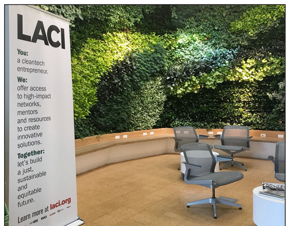
Los Angeles Cleantech Incubator